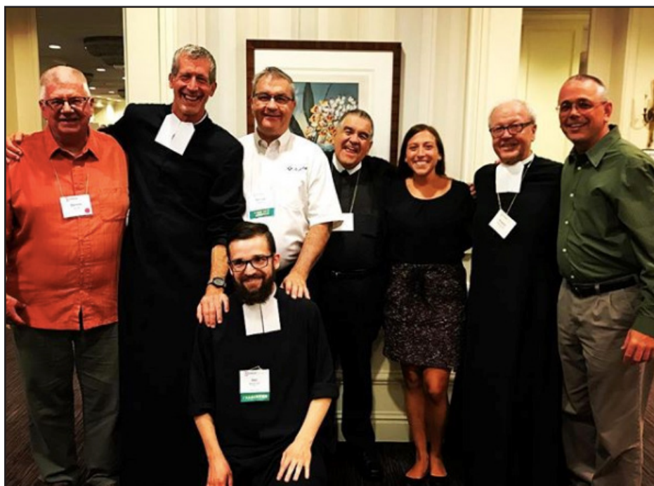
I spent time with Brothers at the Conference of Major Superiors of Men during my first week on the job as Young Lasallian Coordinator!

I am blessed to have shared in this mission as an LV and to be able to continue on this path as an LV alum.